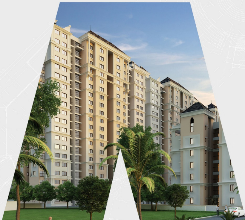
A PURAVANKARA HOME AT PURVA WESTEND